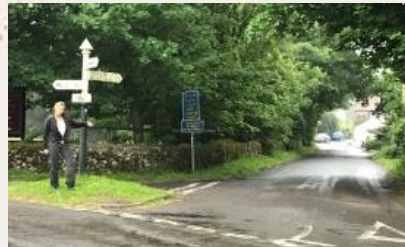
Leg5-1. Fork right towards the Queen Victoria