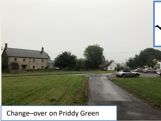
Change-over on Priddy Green