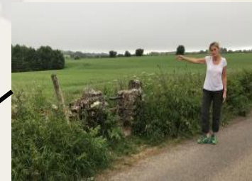
Leg5-1. Fork right towards the Queen Victoria