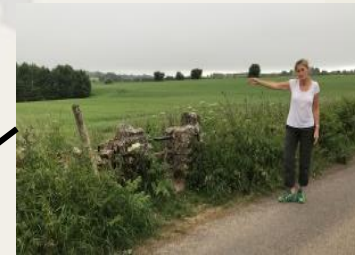
Leg5-2. Turn left at the hidden stile and follow the field boundary