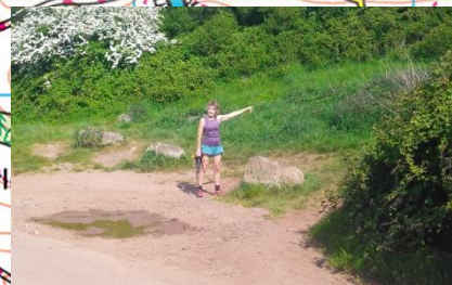
Leg2-3. Just after mobile phone mast, turn sharp right onto footpath