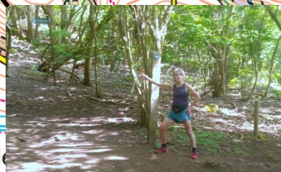
Leg2-4. Double-back left and begin to climb steeply - keep left of Crook Peak when the path levels off