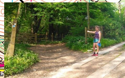
Leg2-8. Keep left at the junction