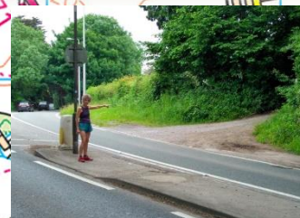
Leg2-7. Carefully cross A38 at 2 nd traffic island and follow track upwards