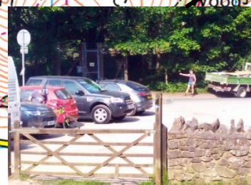
Leg2-6. Cross car-park and road, and take path to right into the trees