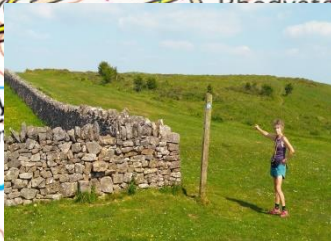
Leg2-5. Head towards Wavering Down and then continue on straight-ahead